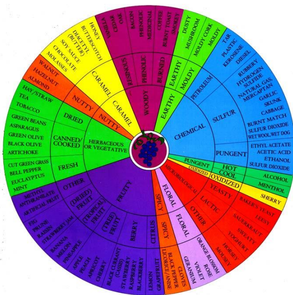
Figure 1. Wine Aroma Wheel, adapted from Noble and Shannon [12], provided to the panellists.

Of each Port style, two wines were tasted and discussed by twelve trained panellists over three sessions in an attempt to generate terms. Each session lasted around 1 hour. In all the sessions, the Wine Aroma Wheel [12] was provided to facilitate term generation (Fig. 1). Appearance (Fig. 2), aroma, taste, flavor and mouthfeel references were provided to facilitate the discussion. By analysing the frequency of citations, from an original long list of attributes, a reduced list was compiled. For the development of quantitative references, in order to make reference evaluation as close as possible to wine-tasting conditions, identical glasses as used for wine evaluation [13] were used for the aroma reference presentation (Fig. 3).