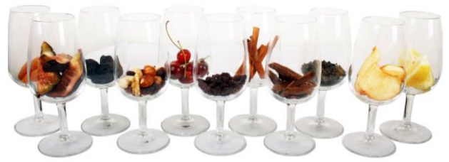
Figure 3. Natural products associated with Port Wine aroma.

After all the references were developed, 3 training sessions were carried out according to the methodology that would be used to evaluate the wines (Tab. 2, at the end of the article).