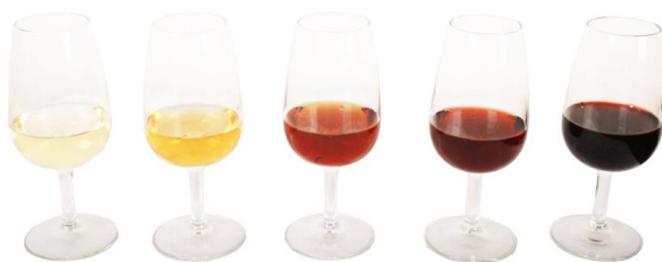
Figure 2. References for Port wine colors.

After all the references were developed, 3 training sessions were carried out according to the methodology that would be used to evaluate the wines (Tab. 2, at the end of the article).